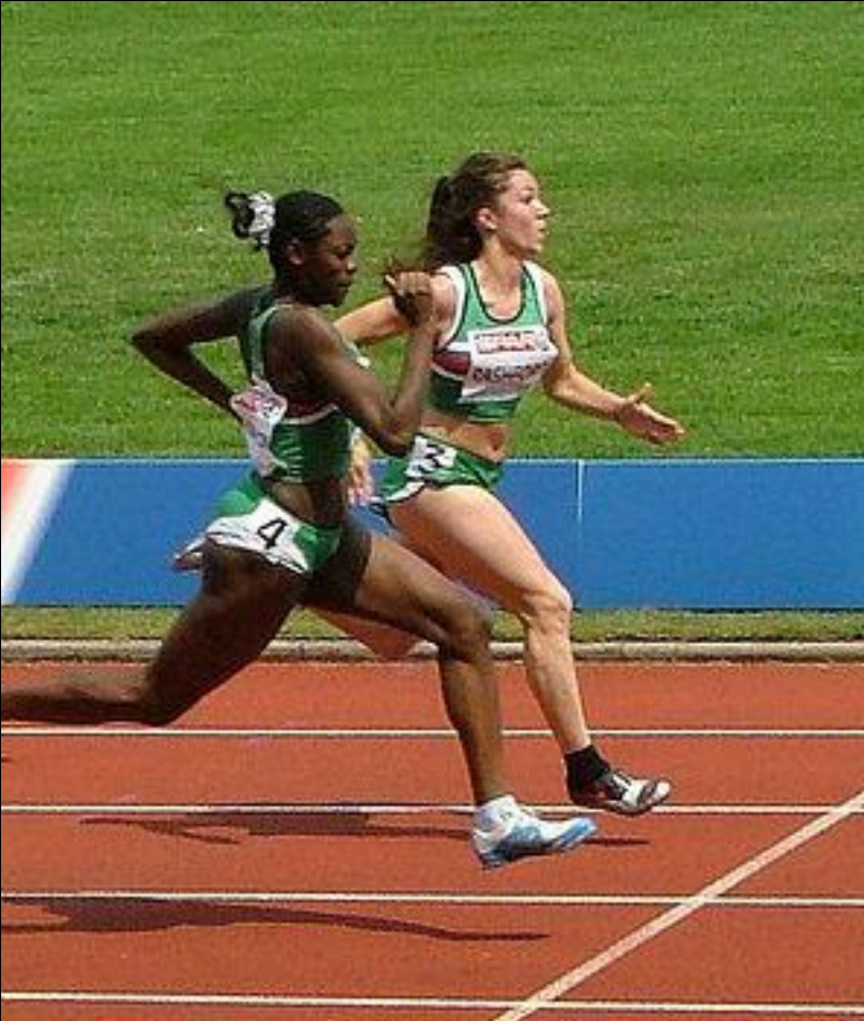
SPAR Sprints 100m under 17 Women